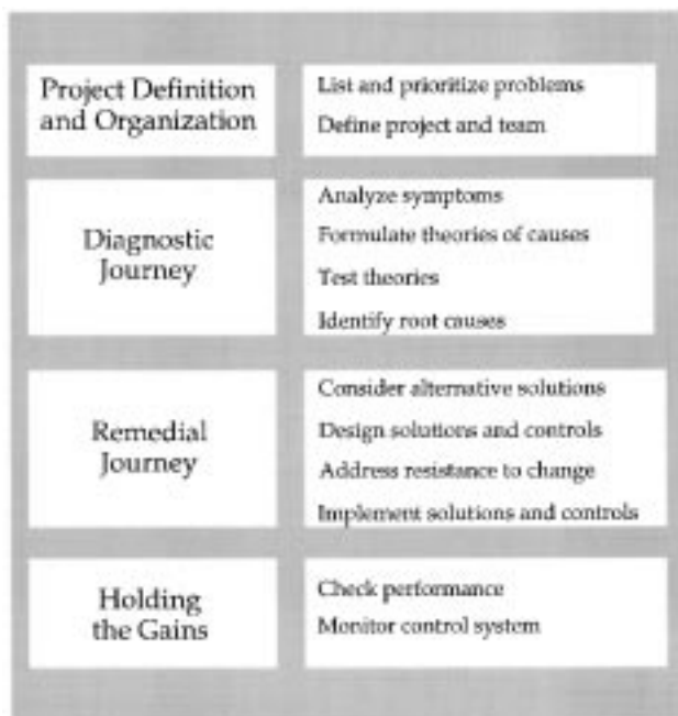
Fig 1. Quality improvement project model. Such models provide high-level, problem-solving guidance to improvement teams. This model is based on the work of Joseph Juran, as described in Plsek PE, Onnias A, Early J. Quality Improvement Tools . Wilton, CT: Juran Institute; 1989.

Having formed specific questions, the improvement team typically gathers data using simple check sheets, data sheets, interviews, and surveys. A check sheet is a form for gathering data that enables one to analyze the data directly from the form. For example, a team working to improve the timeliness of the administration of thrombolytic therapy to chest pain patients in the emergency department might construct a check sheet to study the distribution of times from presentation in the emergency room to administration of the thrombolytic. The check sheet might consist of a sheet of graph paper with a horizontal axis labeled in 10-minute intervals from 0 to 180 minutes. Each time thrombolytic therapy is administered, a responsible nurse places an X in the appropriate 10-minute interval column to indicate the elapsed time since the patient presented. After some time, a histogram of administration times emerges. The mean, spread, and characteristic shape of the time distribution can be read directly from the data collection form. In contrast, a data sheet is a form for recording data for which additional processing is required. In the thrombolytic therapy improvement case, this might be a simple logbook with text and numerical entries for each patient. Interviews and surveys are used when the question of interest involves perceptions. For example, the thrombolytic therapy team might want to monitor patient satisfaction as they change the processes in the emergency department.