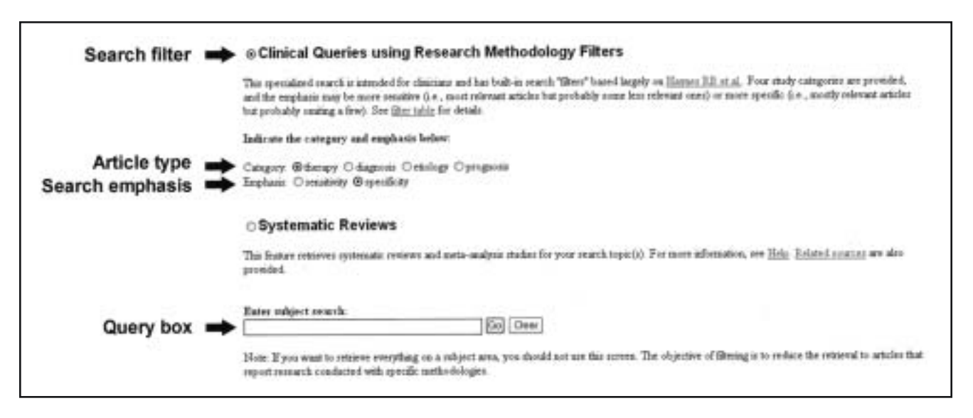
Figure 2. Clinical Queries search filters.

The specific Limits are displayed beneath the Features bar. Placing Limits on the search decreases the number of citations that need to be reviewed to answer your clinical question. Clicking on a citation title "hyperlinks" (ie, different-colored text that links to other Web pages) to the abstract. The user can connect to the full-text article online by selecting the journal icon displayed at the top of the abstract display. In some instances, the article is available or will be after a certain period. In most cases, however, access to the full text is limited to those individuals and institutions subscribing to the electronic version of the publication. For individuals without access to a medical or hospital library, articles can be ordered through the NLM through Loansome Doc (explored in more detail through the Order Documents or the NLM Gateway hyperlink on the blue sidebar on the left-hand side of the screen).